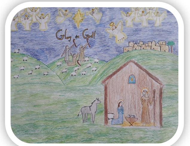
3rd age 8-11yrs Maja Passler Co422 High Wycombe