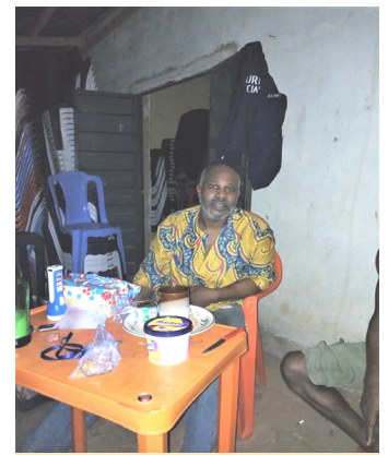
While in captivity

I was sure that praying the Rosary faithfully and asking Mother Mary for help and protection was surely the reason why I was able to get out unharmed. The Rosary is a powerful weapon to protect us. At Fatima, Mary promised that her Immaculate heart was our refuge, and in our prayers to God we should always ask for God's mercy through the Immaculate heart of Mary. A simple message that I feel saved me in the end. ●