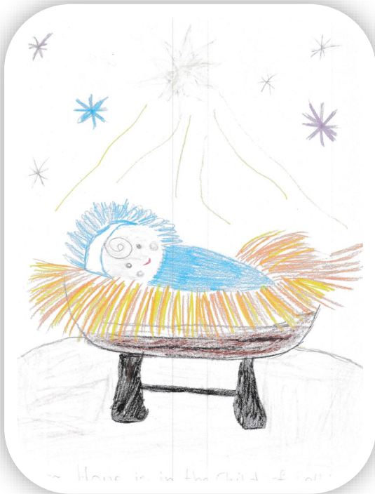
Co970 4_7 1st place