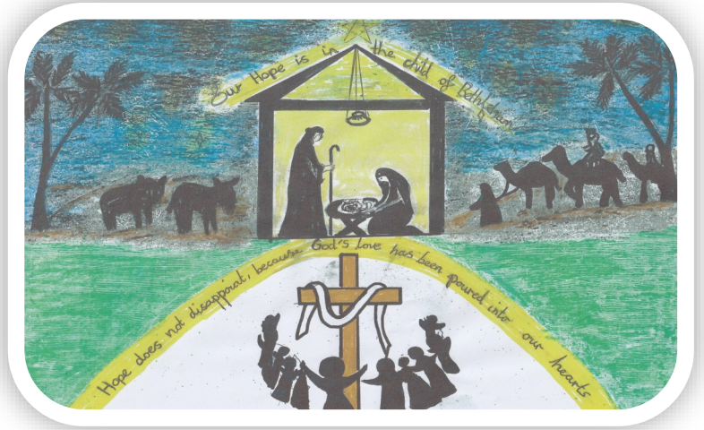
Co970 8_11yrs 1st