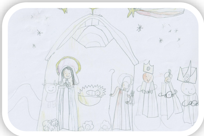
Co295 4_7 3rd place