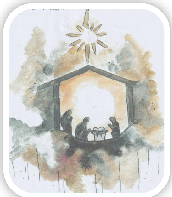
Co295 8_11yrs 3rd