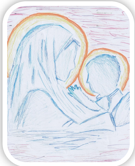
Co984 8_11yrs 2st