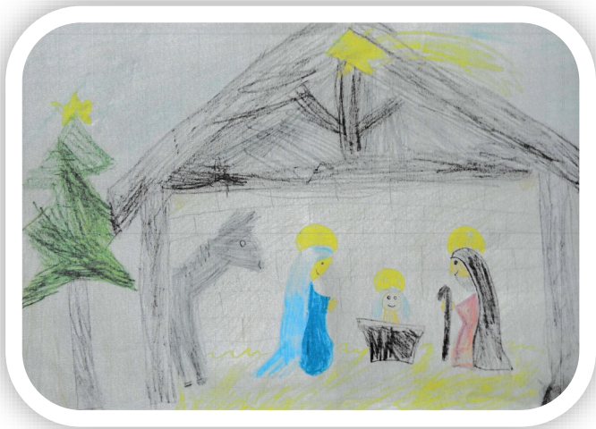
Co984 4_7 1st place