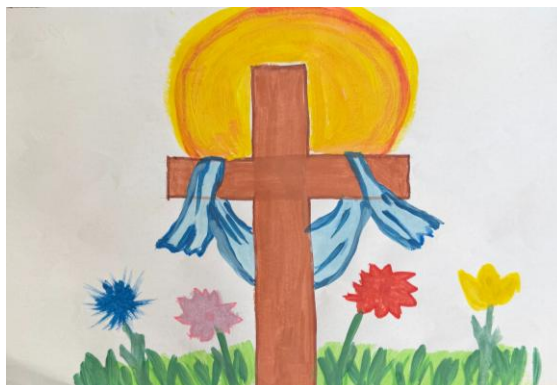
6 th Kacper Co970 Whitton