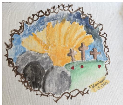
5 th Egnizee Co163 Hanwell