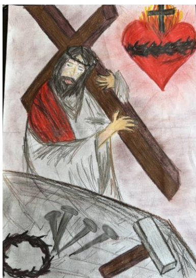
1 st Leon Co163 Hanwell

This year's Primary Schools Easter painting competition attracted fewer entries than usual. Many schools were understandably reluctant to add extra activities for pupils during the holiday period, and this was reflected in the number of schools taking part by the closing date. That said, the standard of work was impressively high, as you can see from the shortlisted winning entries below.